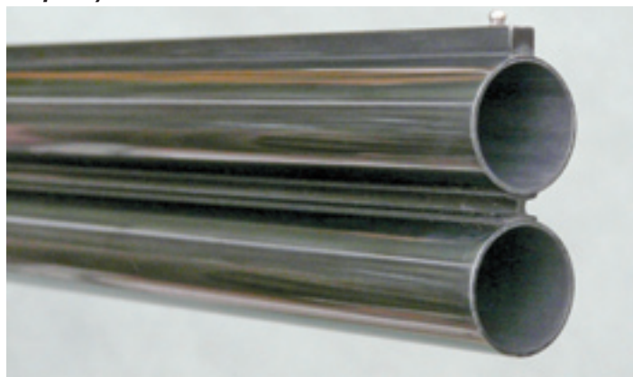
The barrels are machined from a solid section of steel bar

to maintain its reactive yet solid characteristics. Combine this with the London – style forend and this 12 bore's inherent pointability and you have a shotgun that reacts in an instant. The gun drifts to the shoulder whilst the 30" barrels pivot around their muzzle, the view along the 8 – 4.5mm game rib exactly as it should be, my much favoured 'gun down' style became mandatory, the Hesketh floating onto target whilst the Cylinder restrictions still ensured each and every clay shattered in an instant.