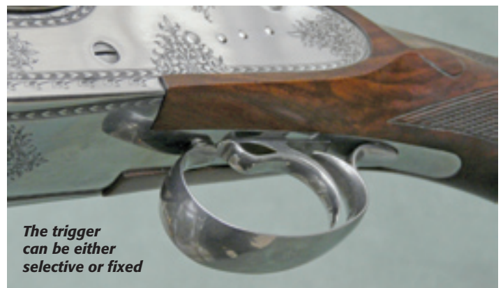
The trigger can be either selective or fixed