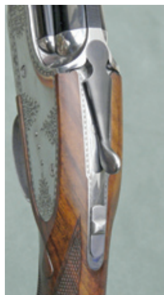
The safety can be either auto or manual.