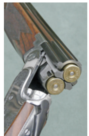
Based on the Boss action, the new Hesketh Longthorne sidelock is as stunning as it is innovative