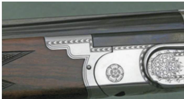
Engraving and detailing are, like the rest of the gun, carried out completely in house

The main reason for this is that like all great game guns it embodies fluidity. Balancing perfectly between the hands, the easy radius and curvature of the grip drops instantly into the hand and merges with the rest of the gun to allow the Hesketh