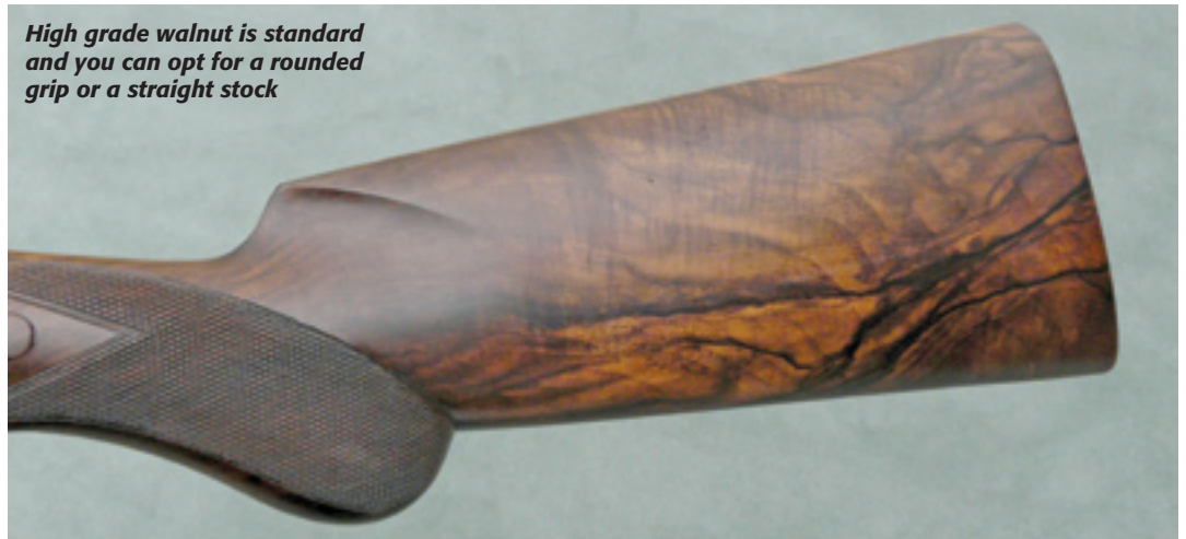
High grade walnut is standard and you can opt for a rounded grip or a straight stock

Hesketh doesn't have to be 'shot-in', the relaxed attitude of the mechanism and bite purposely designed this way.